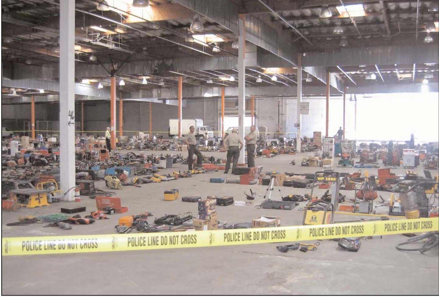
More than $40,000 in Nevada companies' tools were recovered in this recent Ventura County, CA., police raid