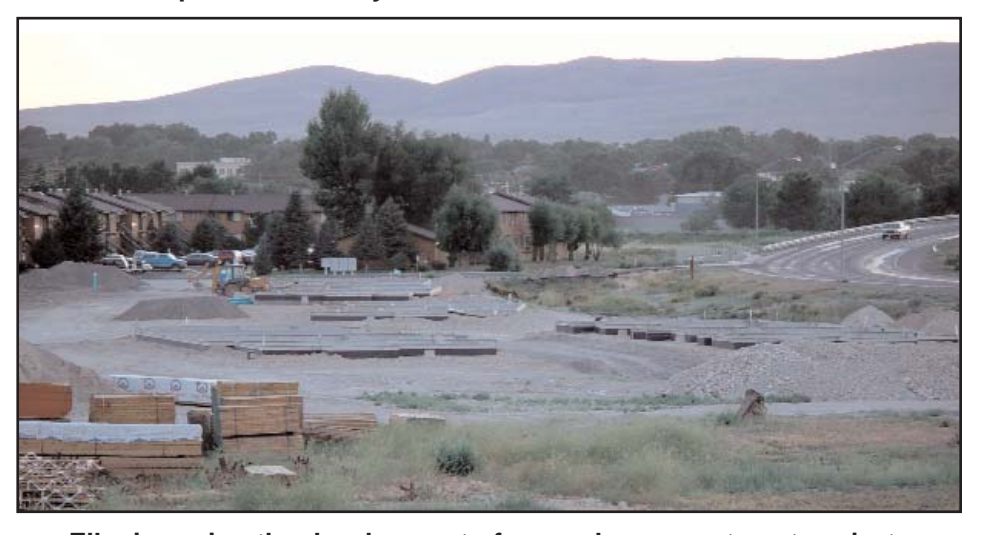
Elko is seeing the development of several new apartment projects

In West Wendover, a new $6 million city hall will be completed this year, and the Northeastern Nevada Regional rail port